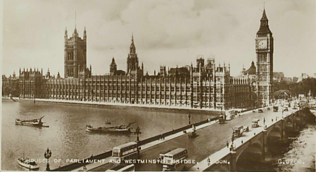
HOUSES OF PARLIAMENT AND WESTMINSTER BRIDGE, LONDON.